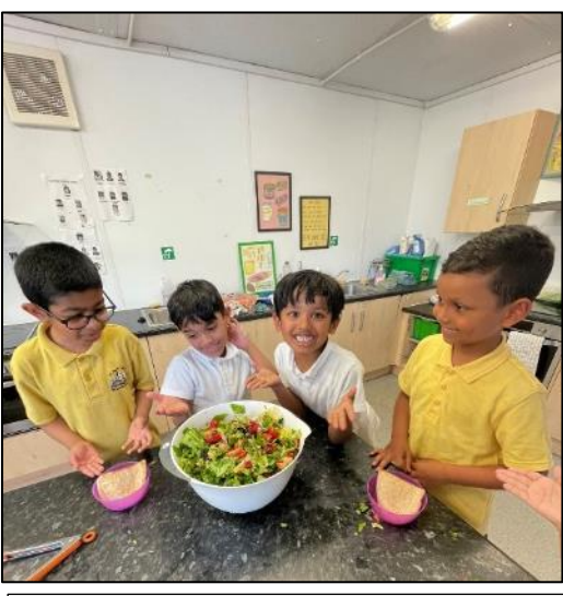
Year 2 made the most delicious vegetarian sausage rolls today. The children were delighted with themselves!

Year 1 put their cooking skills into actions to make a summer berry salad loaded with fresh berries, avocado, tomatoes, lettuce, spring onions and coriander. Thank you for all the fresh fruits and vegetables.