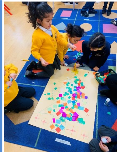
Caterpillar Class making their own Christmas Tree.